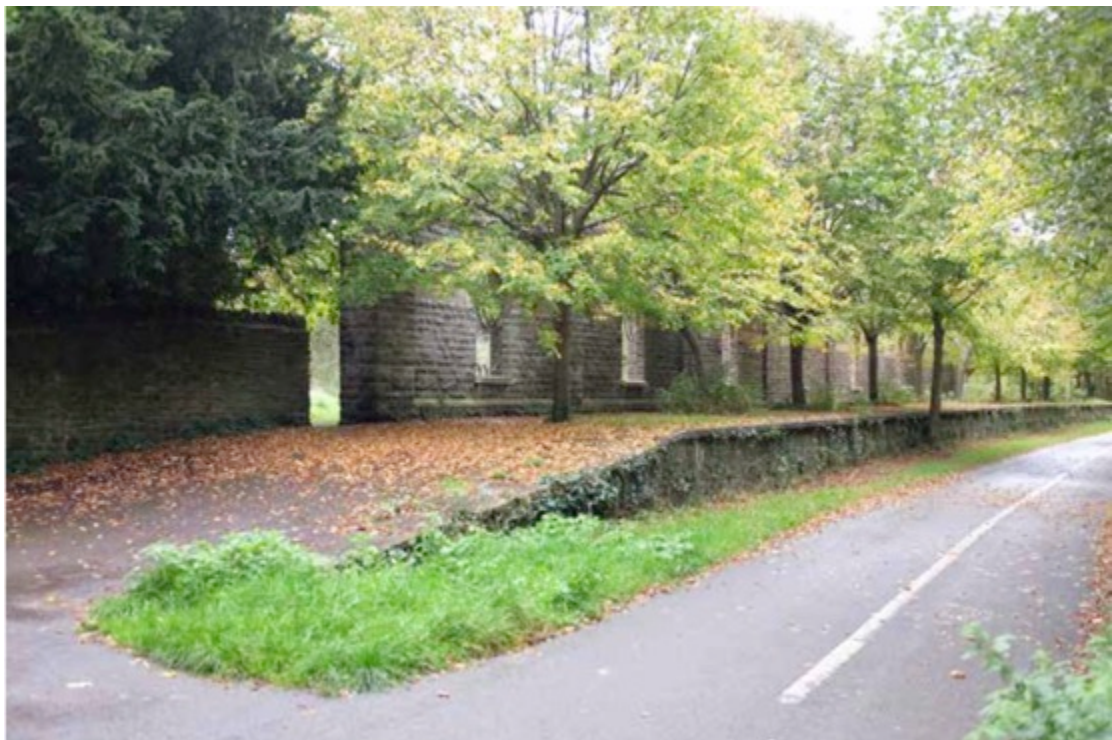
Looking up onto the platform towards the inner garden (accessed through the gap)