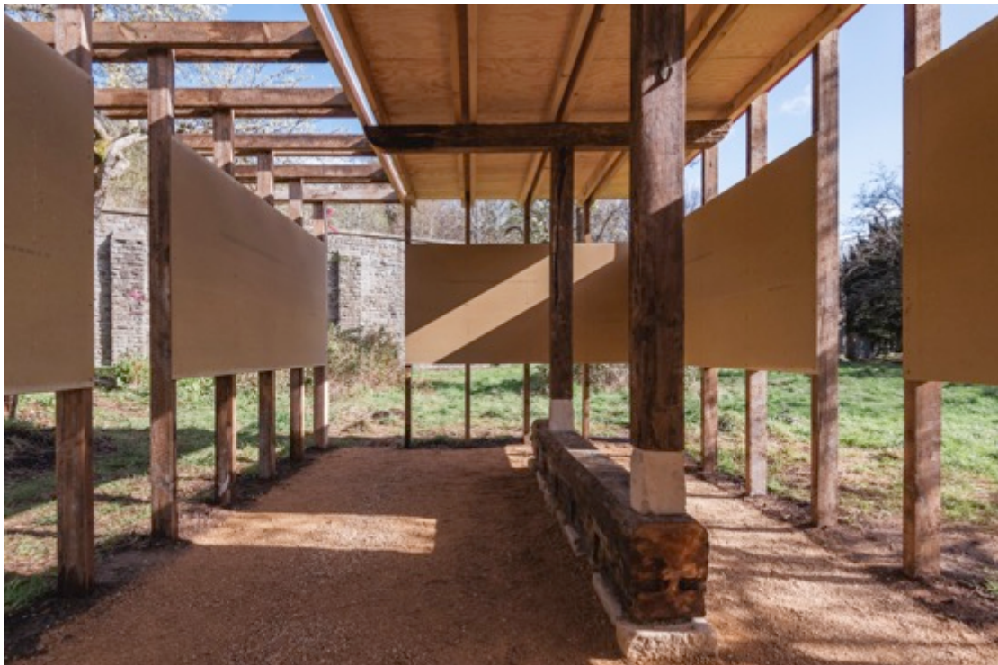
Interior of the Folly (pre-mural), 2022