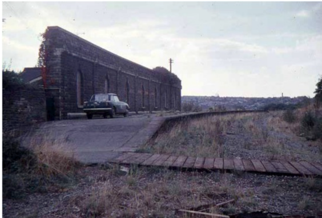
Mangotsfield Station, 1972