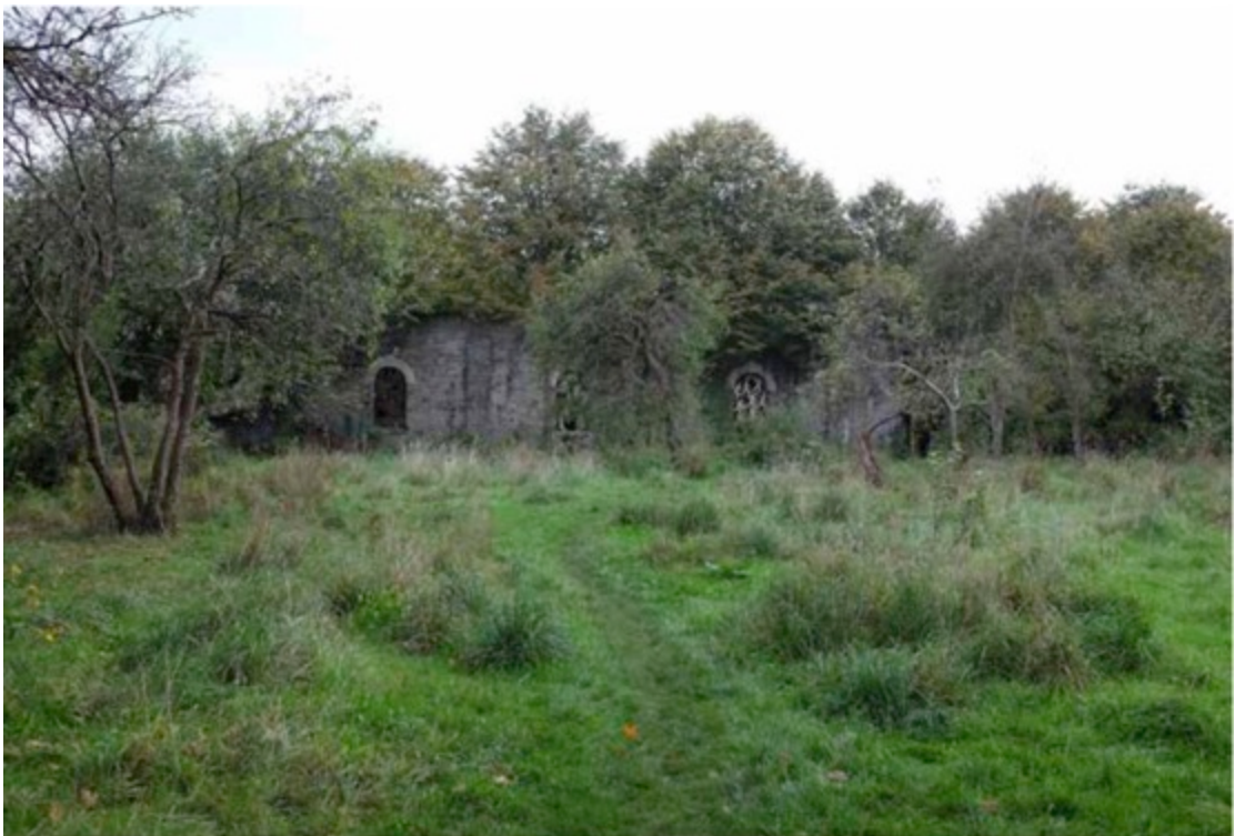
Inside the 'inner garden'