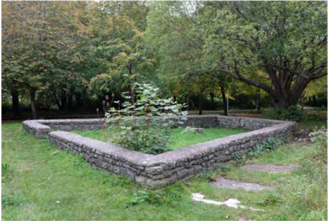
The former booking office foundations (planned site of outdoor table & bench)