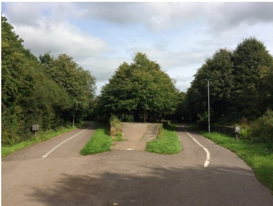
Mangotsfield Station looking towards the station platform and route towards Bath (right hand path)