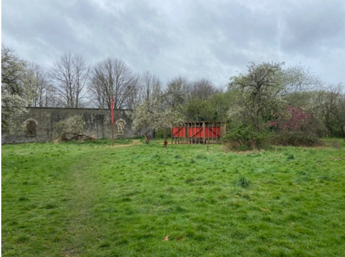
Wide shot showing the Folly in the context of the inner garden