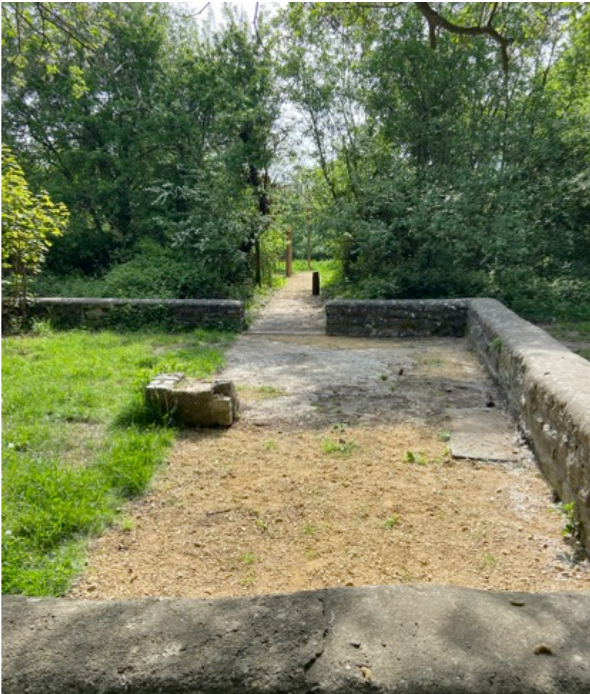
The booking office foundations (site of proposed table) looking towards the Folly and telegraph pole