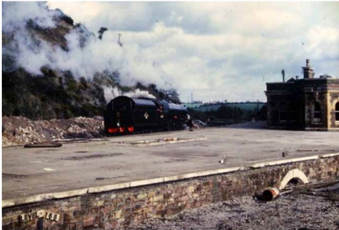
Mangotsfield Station, 1967