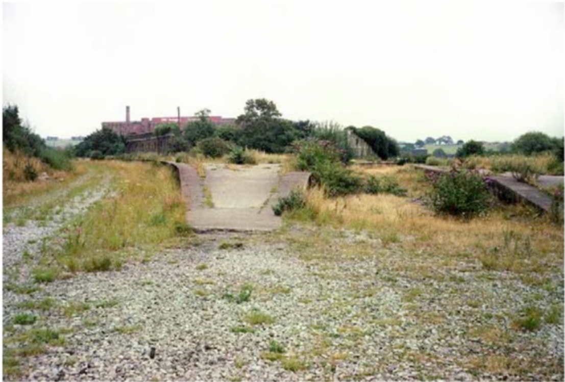
Mangotsfield Station, 1977