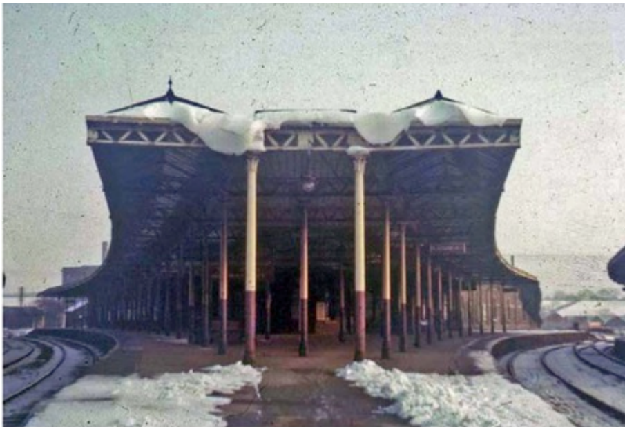
Mangotsfield railway station in 1966

Mangotsfield is close to Fishponds, Downend and Staple Hill. The Railway path is a 13 mile traffic-free route maintained by Sustrans, the charity making it easier for people to walk, wheel and cycle. The railway path was the first route to be developed by Sustrans, opening in 1984. It was also the first part of what would become the National Cycle Network (NCN). The area was once a railway station on the Midland Railway route between Bristol and Birmingham, serving what is now the Bristol suburb of Mangotsfield. The station closed in 1966 when services to Bath ended, and the line through it closed in 1969. The railway line became an 'active travel' route in the 1980s, and Mangotsfield station became a popular place to stop and rest as several of the station's walls and platforms are still in situ (and grade II listed). The station is leased to Sustrans by South Gloucestershire Council.