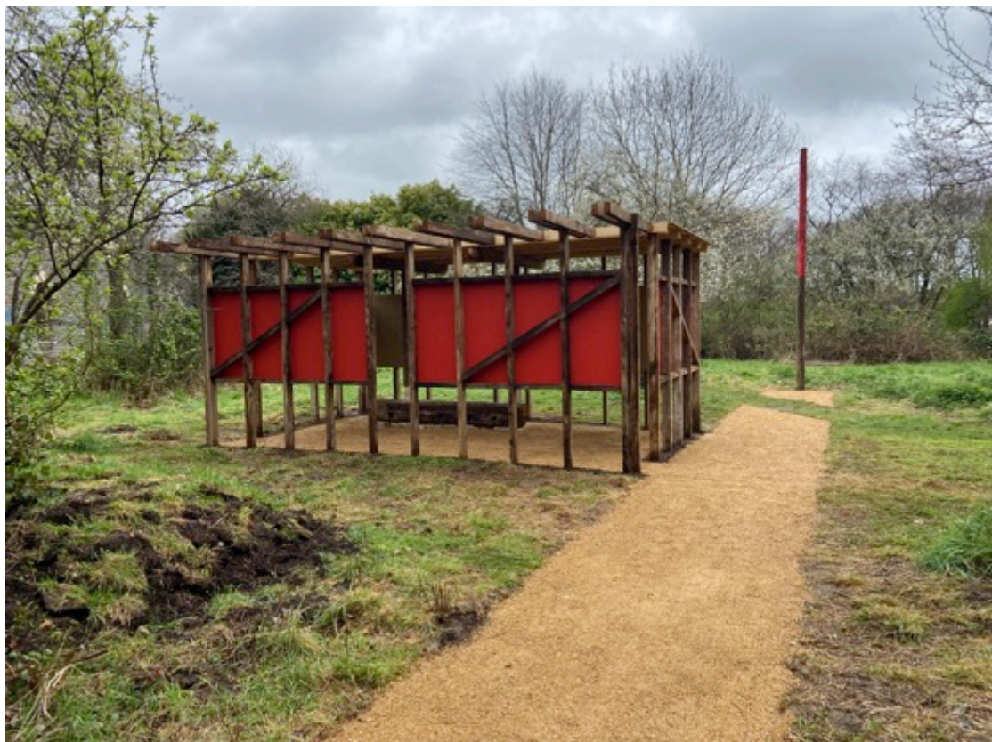
The Folly showing the path, 2022