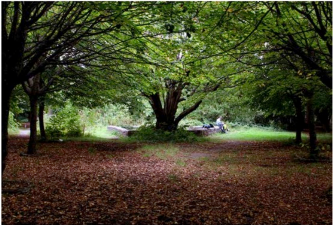
Looking along the platform towards the booking office foundations