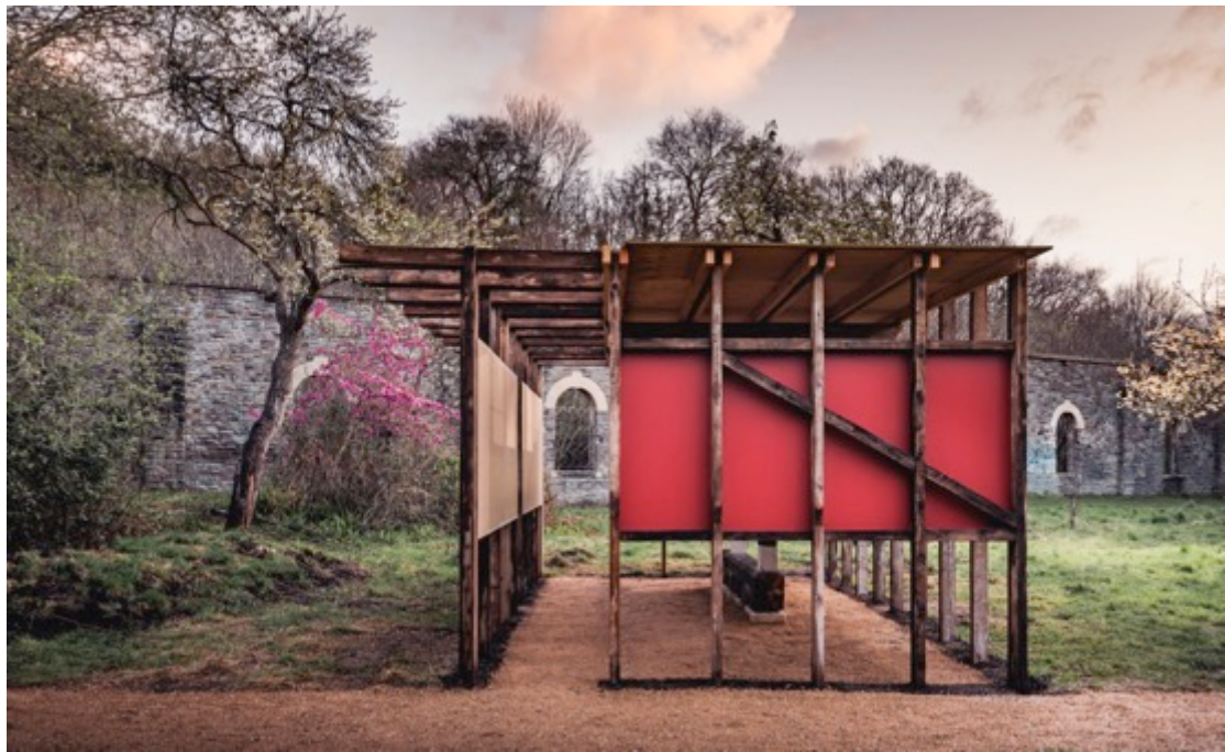
The Folly, 2022