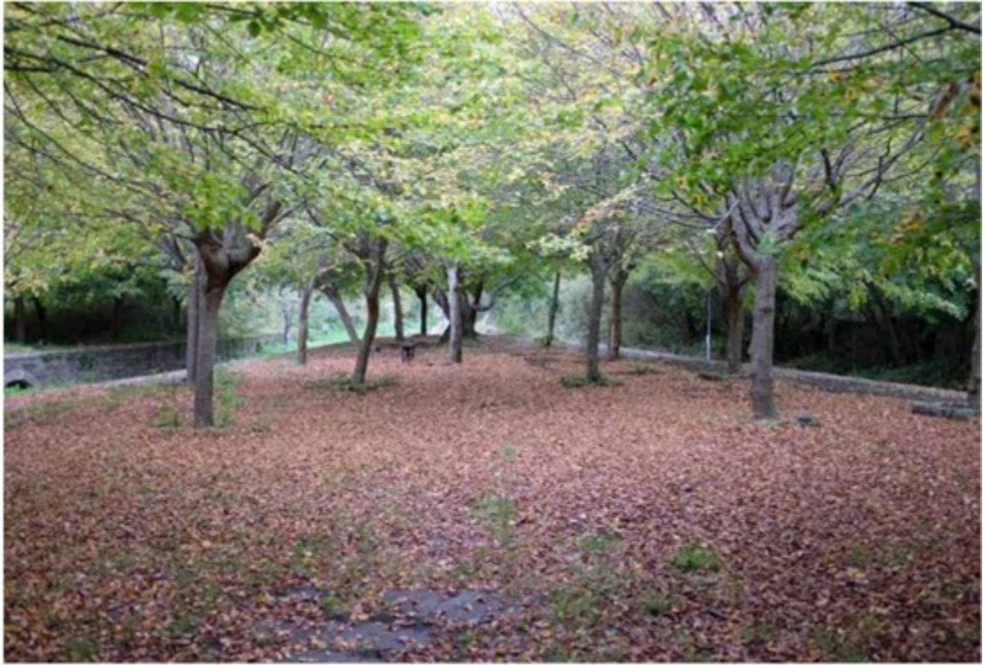
Looking along the platform towards Bristol