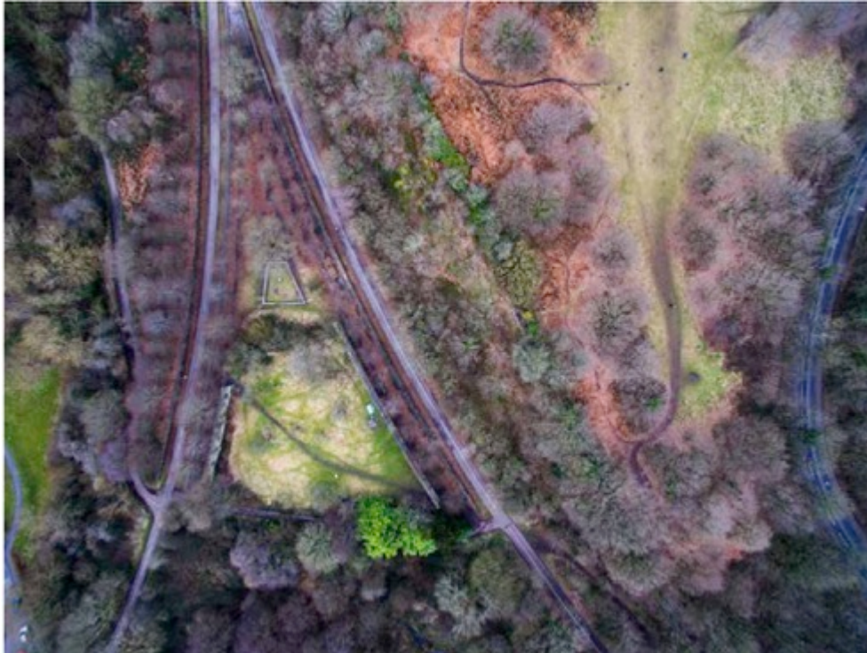
An aerial photo of Mangotsfield Station (the 'triangular' area shows the area within the station walls – the inner garden - and elevated on the platform)