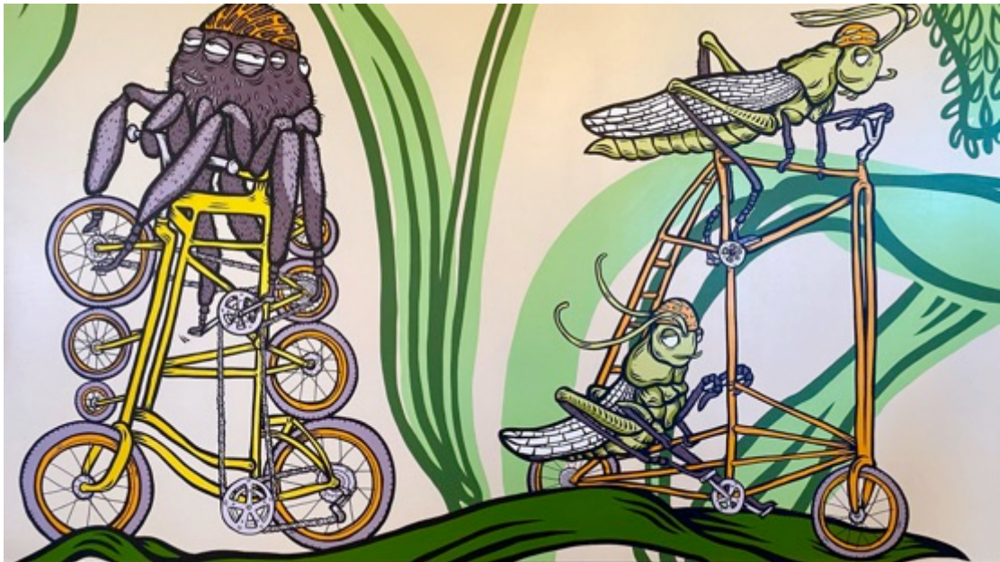
One of the mural panels designed by Lucas Antics (WIP)

At the end of May 2022 Mangotsfield Folly was also used by twelve 2 nd year Fine Art students at Bath Spa University to display their 'off site' project. (see the instagram feed for examples of work shown)